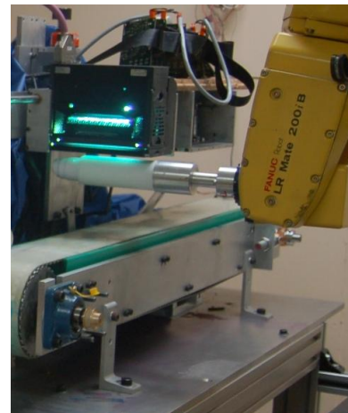
Digital inks are cured almost instantly by UV lamps supplied by Integration Technology, Ltd.