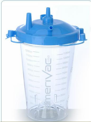
Ameri-Vac is able to custom imprint on these cone shaped medical vacuum canisters using Scribe's 3-D inkjet technology.

That may be why application engineers at Konica-Minolta, one of the leading inkjet print head manufacturers, send leads Scribe's way. "Konica-Minolta gets lots of calls from customers looking at inkjet for their printing – and they send us the ones who have something other than a flat part". Scribe has forged a strong relationship with all their key suppliers including Industrial Inkjet Ltd., the official distributor and technical support centre for Konica Minolta industrial inkjet products sold throughout much of the world.