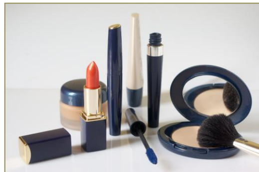
High-quality cosmetics manufacturers look to digital inkjet as a solution to packaging problems where both beauty and flexibility are required for their packaging.

Perhaps the most unique aspect of Scribe's technology is their ability to manipulate parts underneath inkjet print heads and UV lamps in such a way that they can apply images to virtually any shaped part. "The ready availability of very precise 6-axis servo robots allowed us to begin experimenting with parts that were impossible to print with flat-line systems" explains Frank Pagano, Scribe's engineering manager. "The robot can pick up an odd shaped part and place it in just the right spot for printing and curing. Controlling the motion of these parts under delicate print heads and UV lamps requires extreme precision that requires both mechanical and